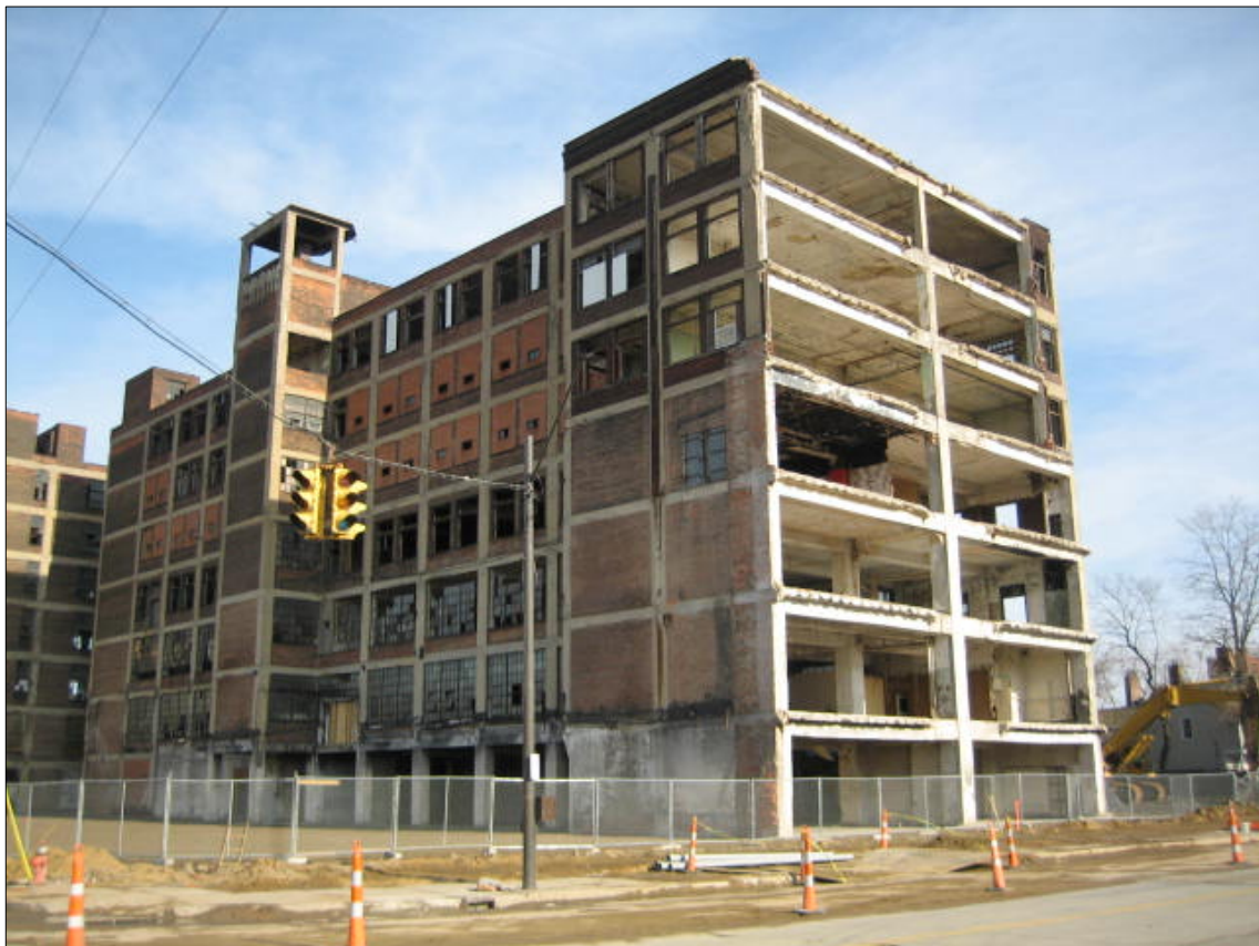
Figure 7 Proposed RTA TOD Site, 6611 Euclid Avenue