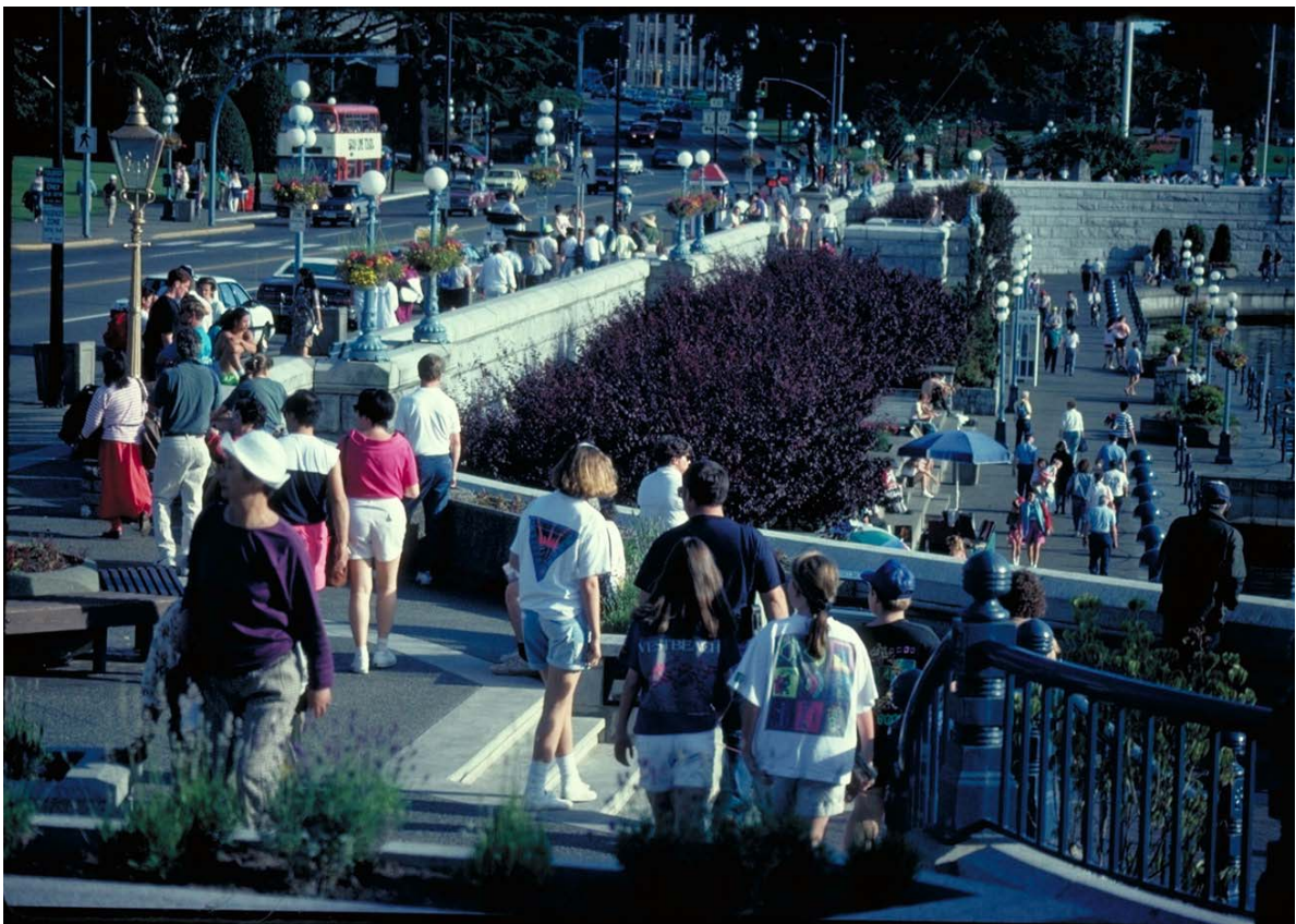
Figure 10 Provide Public Gathering Places to Create an Active, Vibrant Location