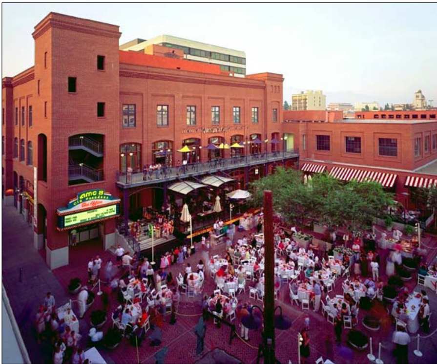
Figure 14 Active Uses on Ground Floor; Less Active Uses Above