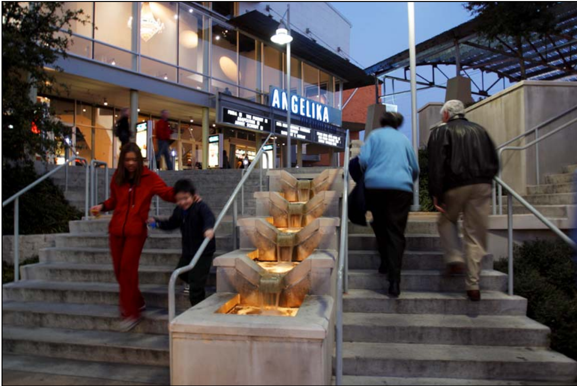
Figure 4 Joint Development at Mockingbird Station, Dallas, Texas

Many developers and investors, however, strongly preferred outright ownership to lease agreements. The FTA's new joint development policies allow an authority to sell land and keep the proceeds, so long as they are used to support the authority's mission of providing transit service. Since this change, many authorities have shifted to fee-simple sales, attracting stronger developer interest as a result. This has increased the pool of developers responding to RFPs and has made recent joint development deals generally more remunerative. In addition to service improvements and maintenance, the new FTA policies allow transit authorities to place property/air rights sales revenue into a revolving fund to support additional TOD activity. 3