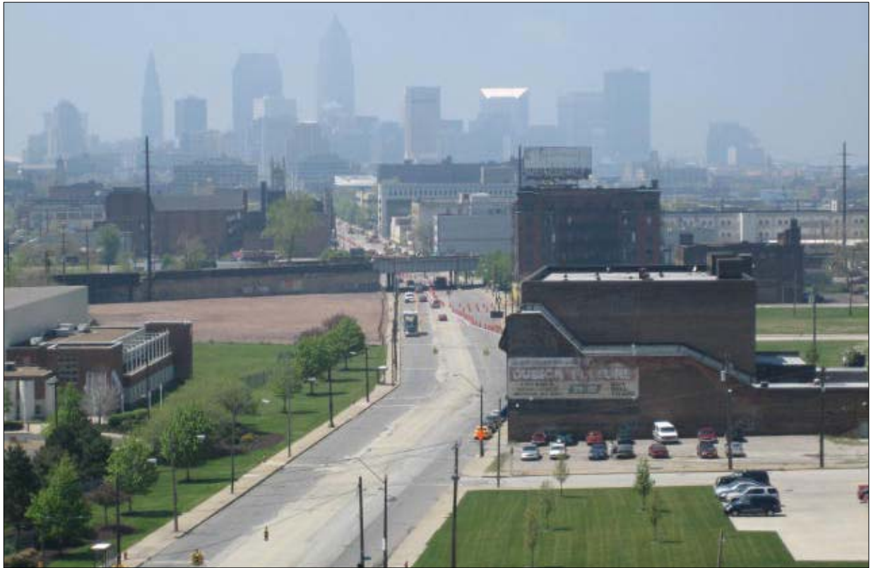
Figure 9 Future RTA TOD Site at 4501-4701 Euclid Avenue