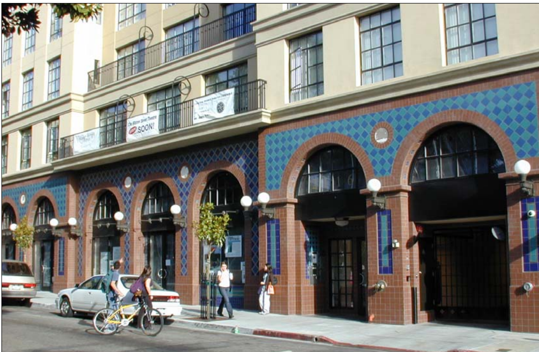
Figure 12 Parking Facilities Feeding Pedestrians Directly to Pedestrian Routes and Serving Both Autos and Bicycles