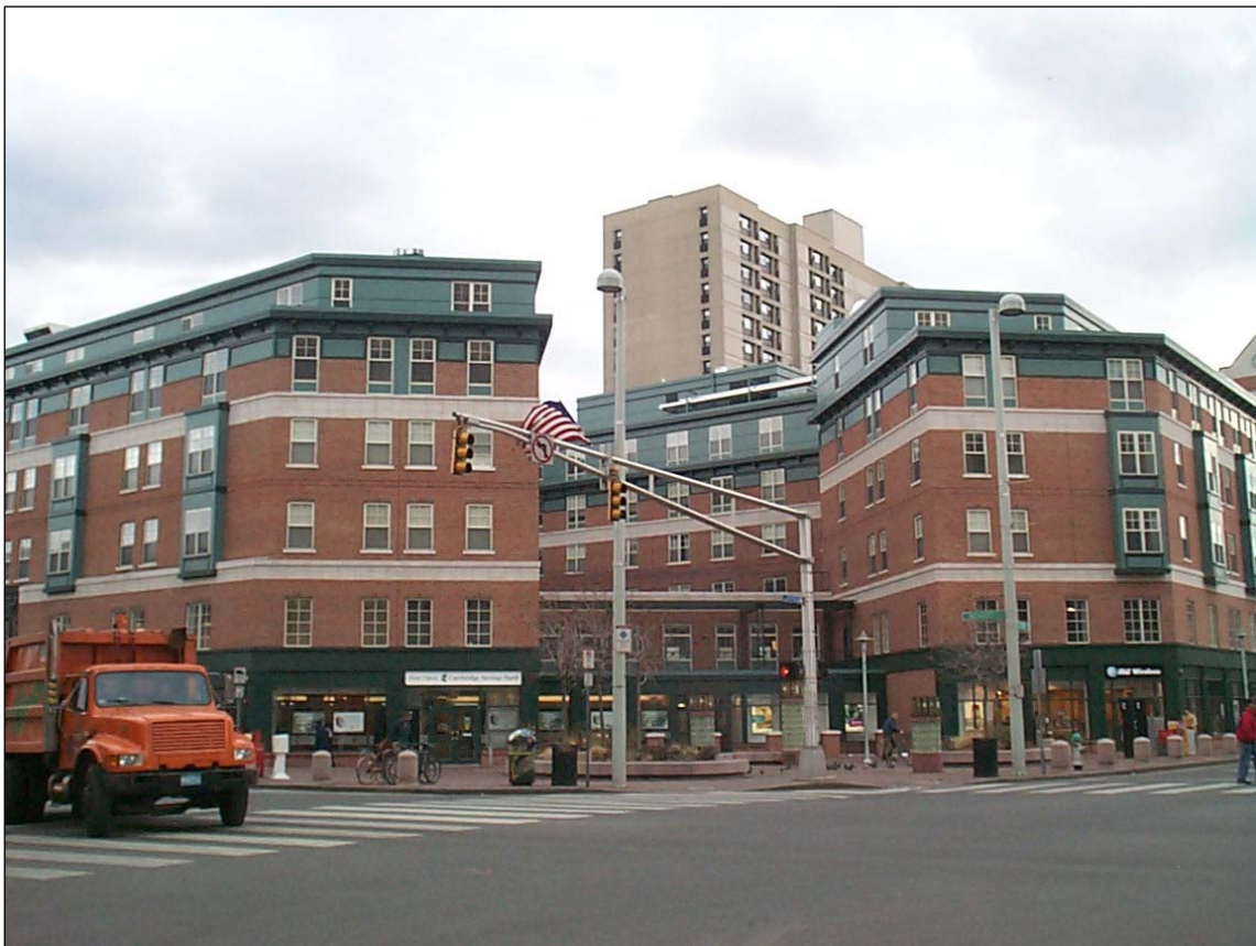
Figure 11 Building Frontages with Active Streetwalls and No Street-Facing Parking (Cambridge, MA)

Whether a commuter is riding the train, a shopper is driving to a store, or a student is bicycling to school, every trip starts and ends as a walking trip. A TOD should provide a safe, welcoming pedestrian environment throughout the community, so that all travelers can walk along an interesting and safe route between their homes, offices, transit stops, or other destinations.