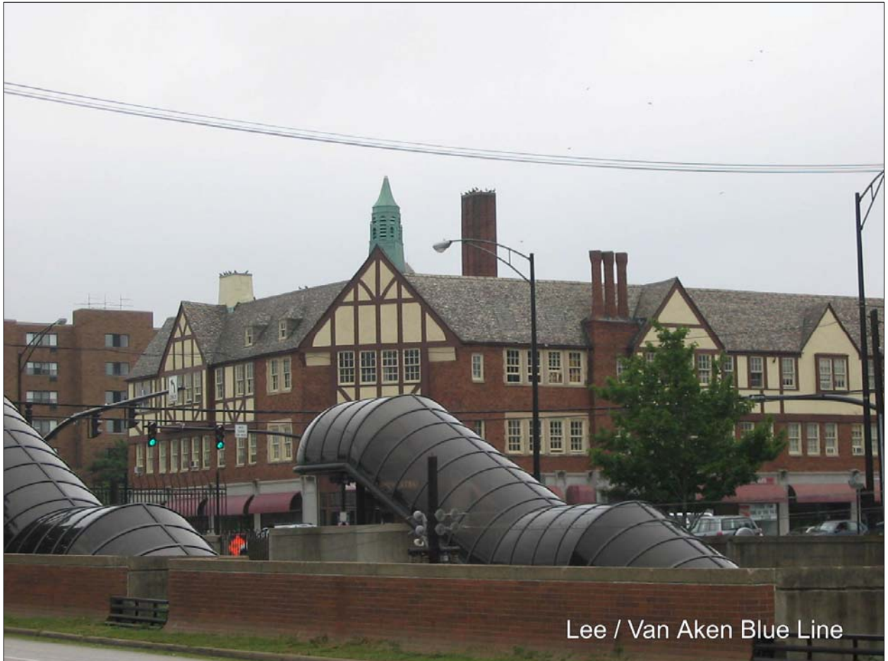
Figure 6 Lee/Van Aken Blue Line Rapid Transit Station