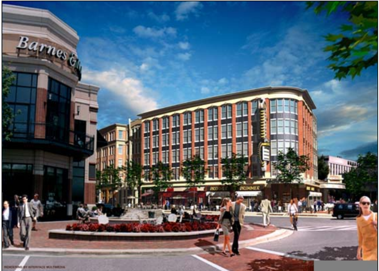
Figure 3 Bethesda Row Station Area Project, Bethesda, Maryland